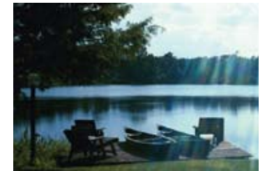
Oviedo, Florida March 1-6