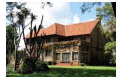
Nairobi, Kenya May 4-9