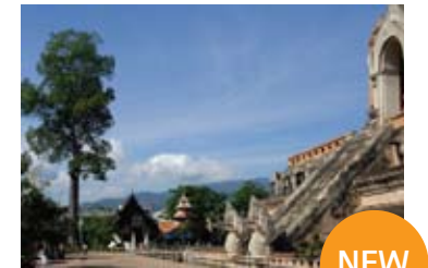
Chiang Mai, Thailand October 19-23